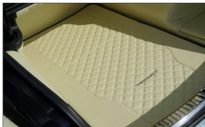
Exclusive leather trunk mat RR8 368 760 with MANSORY logo stitching Special designs optionally available on customers request.