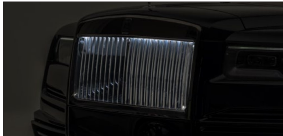
Ambiente grille Illumination .....RR8 210 223 addition Illumination with manual switch