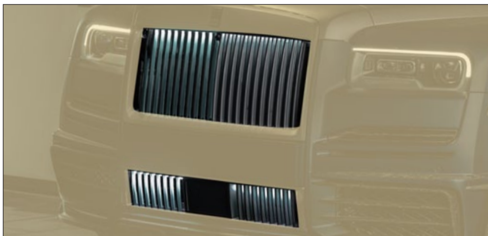
Ambiente grille and front bumper Illumination with two tone painting lamels .....RR8 210 222 addition Illumination with manual switch / 2 parts set *compatible only with mansory wide body kit * installation remain reserved at Mansory headquarters