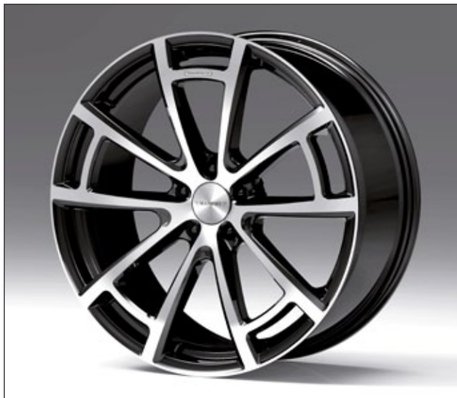
CS.5 22 inch ( Diamond silver ) CS5 22 95 35 112 S CS.5 22 inch ( Diamond anthracite ) CS5 22 95 35 112 A CS.5 22 inch ( Diamond black ) CS5 22 95 35 112 B FA: 1pc., 9,5x22 OS35 + 15mm spacer CS.5 22 inch ( Diamond silver ) CS5 22 105 35 112 S CS.5 22 inch ( Diamond anthracite ) CS5 22 105 35 112 A CS.5 22 inch ( Diamond black ) CS5 22 105 35 112 B RA: 1pc., 10,5x22 OS35 + 30mm spacer

* price per piece / without tire / without spacers