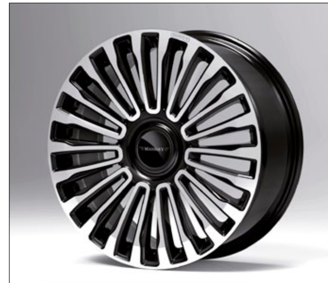
CS.11 22 inch ( Diamond silver ) CS11 22 9 30 1230 S CS.11 22 inch ( Diamond anthracite ) CS11 22 9 30 1230 A CS.11 22 inch ( Diamond black ) CS11 22 9 30 1230 B 1pc., 9x22 OS30 + 20mm spacer CS.11 22 inch ( Diamond silver ) CS11 22 105 42 1230 S CS.11 22 inch ( Diamond anthracite ) CS11 22 105 42 1230 A CS.11 22 inch ( Diamond black ) CS11 22 105 42 1230 B 1pc., 10,5x22 OS42 + 30mm spacer

* price per piece / without tire / without spacers