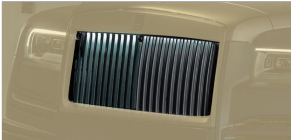
Ambiente grille Illumination with two tone painting lamels .....RR8 210 221 addition Illumination with manual switch * installation remain reserved at Mansory headquarters