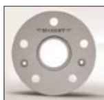
Spacers for FS.23 24" RR8 FS23 15

✂ recommended tyre size - Front: 295/30/24 Rear: 295/30/24