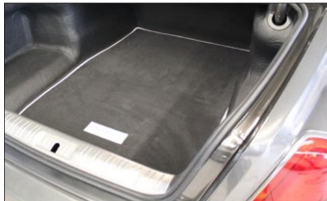
Exclusive velour trunk mat - nubuck edging RR8 368 758 with MANSORY logo stitching Exclusive velour trunk mat - leather edging RR8 368 759 with MANSORY logo stitching