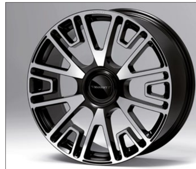
V.6 wheel 24" fully forged V6 24 10 25 112 B