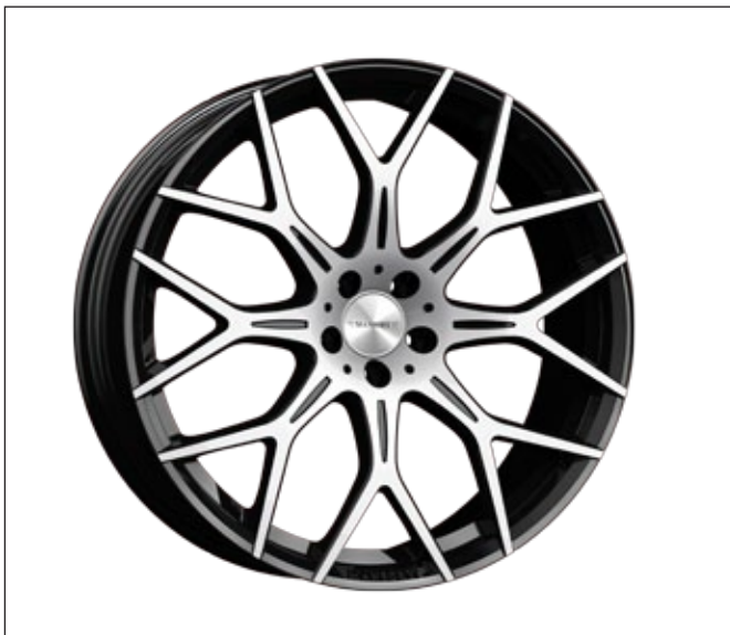
N.80 23 inch( Diamond black ) N80 23 105 45 112 B N.80 23 inch ( Diamond anthracite ) N80 23 105 45 112 A FA: 10.5x23 ET 45 + 25mm sapcer