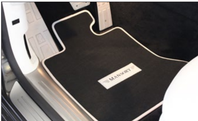
Exclusive velour floor mats - nubuck edging RR8 367 758 4-parts set, with MANSORY logo stitching Exclusive velour floor mats - leather edging 4-parts set, with MANSORY logo stitching RR8 367 759