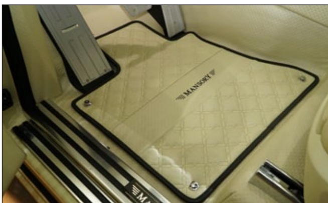
Exclusive leather floor mats RR8 367 760 4-parts set with MANSORY logo stitching Special designs optionally available on customers request.