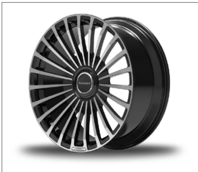
FS.23 24" fully forged wheel FS23 24 10 20 1230 B