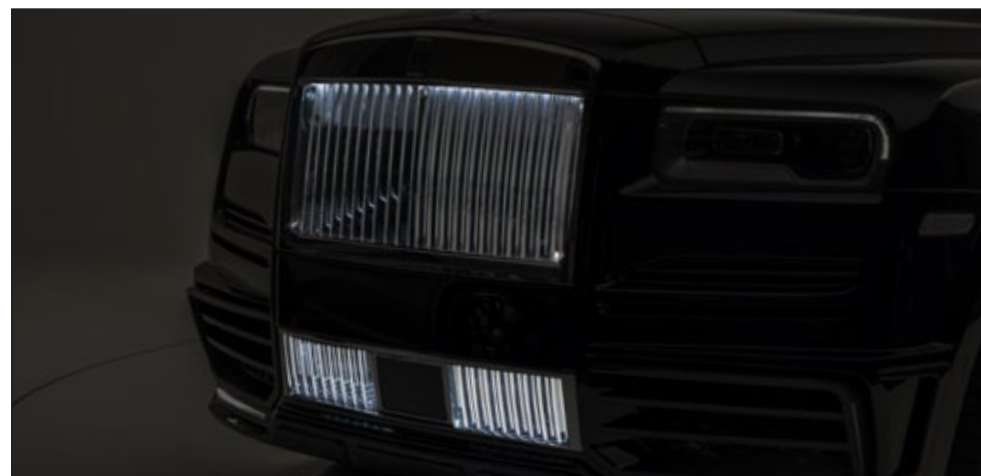
Ambiente grille and front bumper Illumination .....RR8 210 224 addition Illumination with manual switch 2 parts set *compatible only with mansory wide body kit