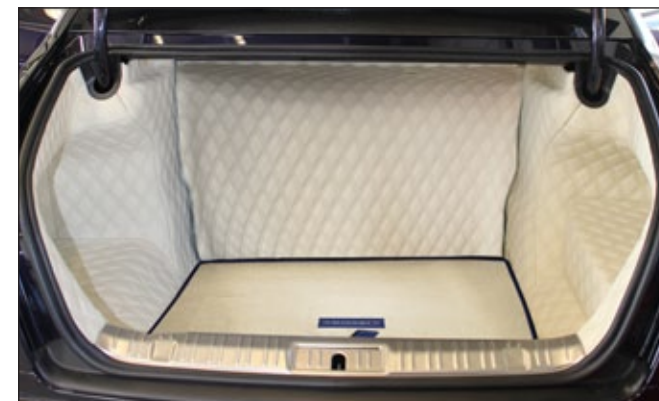
Trunk house decor RR8 368 500 Complete refined trunk compartment, by exclusive leather sorts, combination on customers request.