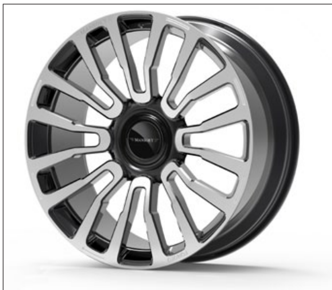
Y.8 wheel 24" fully forged wheel Y8 24 10 25 112 B