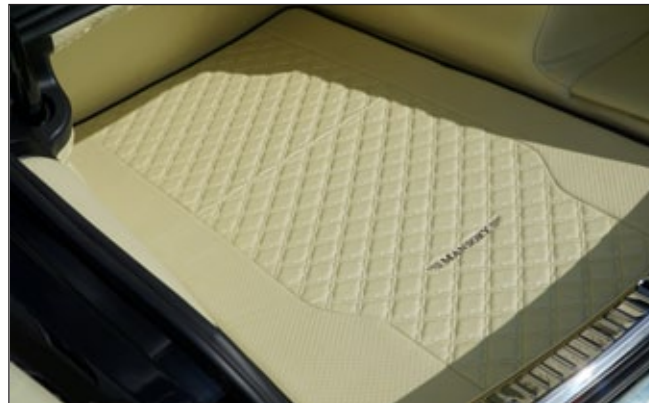
Exclusive leather trunk mat RR4 368 760 with MANSORY logo stitching Special designs optionally available on customers request.