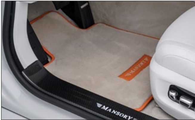
Exclusive velour floor mats - nubuck edging RR4 367 758 4-parts set, with MANSORY logo stitching Exclusive velour floor mats - leather edging 4-parts set, with MANSORY logo stitching RR4 367 759