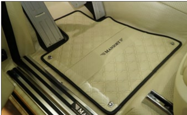
Exclusive leather floor mats RR4 367 760 4-parts set with MANSORY logo stitching Special designs optionally available on customers request.