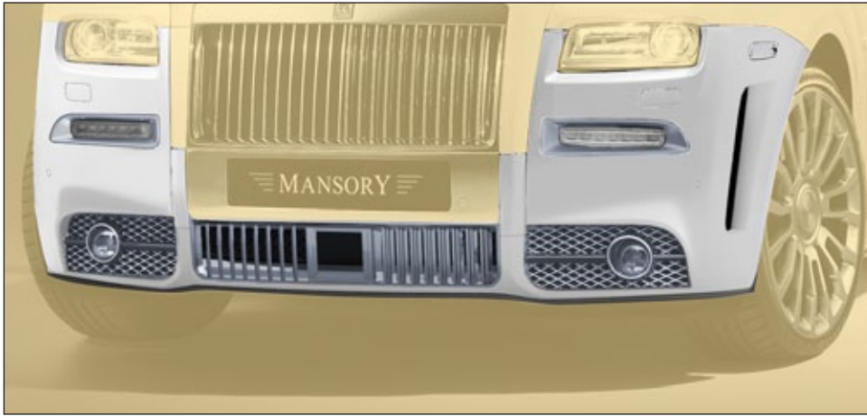
Front bumper II with air outlet - LED + FOG light RR4 102 062

front lip visible carbon fibre primed without clear coat, middle slats chrome LED daytime running and fog lights