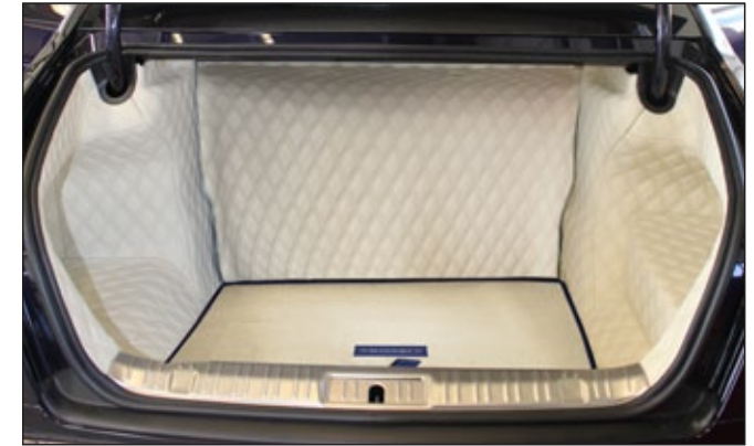
Trunk house decor RR4 368 500 Complete refined trunk compartment, by exclusive leather sorts, combination on customers request.