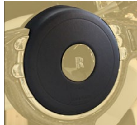
Airbag cover ..... RR4 351 500 available with leather, alcantara, ⚙️ modification only, OE-part required