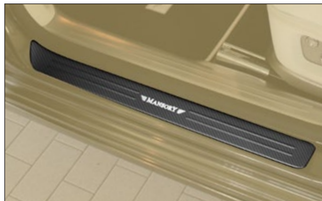
Entrance panels with illuminated ..... RR4 395 351 MANSORY logo Entrance panels with MANSORY logo ..... RR4 395 353 4 parts set visible carbon fibre primed without clear coat not compatible with EWB ( long ) GHOST

Complete refined interior, by exclusive leather sorts, combination on customers request.