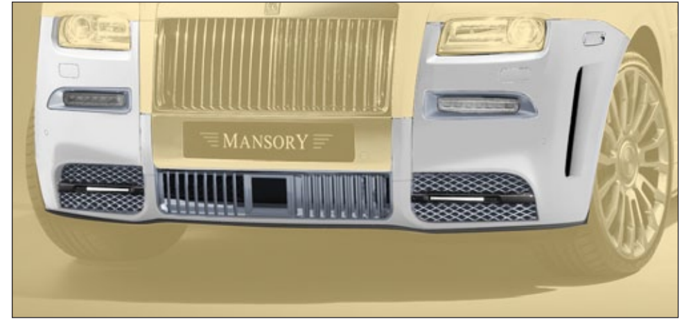
Front bumper II with air outlet - slim DRL RR4 102 182

① compatible for cars with or without ACC sensor