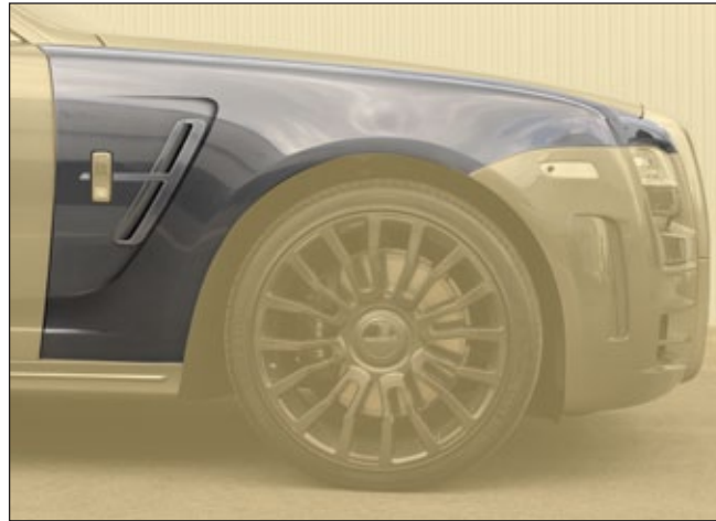
Front fenders Set two