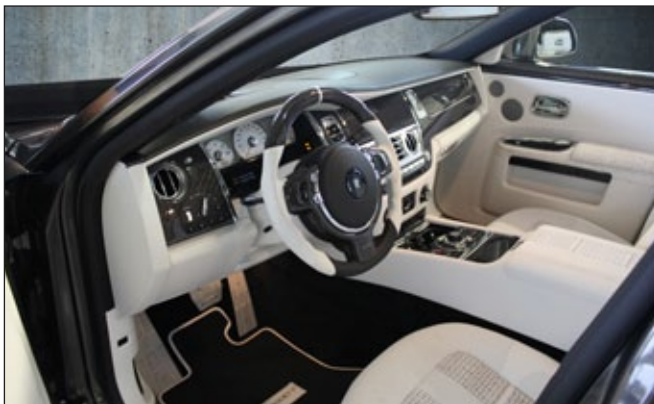
MANSORY Individualized ..... RR4 300 000 Interior Kit

Complete refined interior, by exclusive leather sorts, combination on customers request.