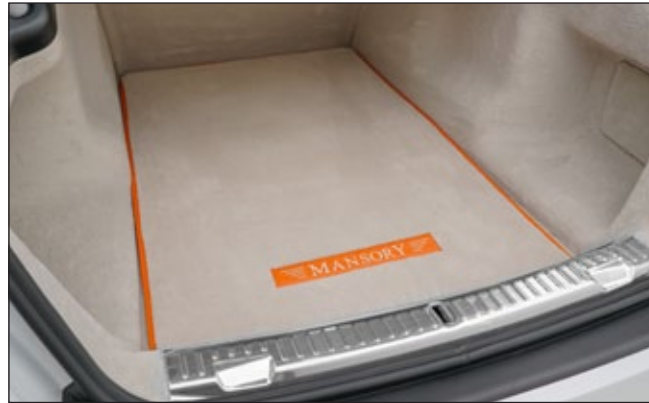
Exclusive velour trunk mat - nubuck edging RR4 368 758 with MANSORY logo stitching Exclusive velour trunk mat - leather edging RR4 368 759 with MANSORY logo stitching