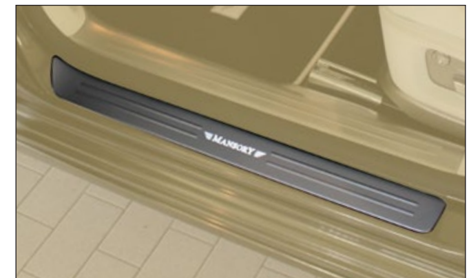
Entrance panels for EWB ( long ) ..... RR4 395 355 illuminated MANSORY logo 4 parts set, with illuminated logo available with carbon fibre or wood veneer. ⚙️ modification only, OE-part required