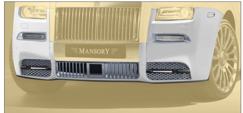
Front bumper II - slim DRL RR4 102 192

① compatible for cars with or without ACC sensor