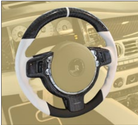
Sport steering wheel with MANSORY logo