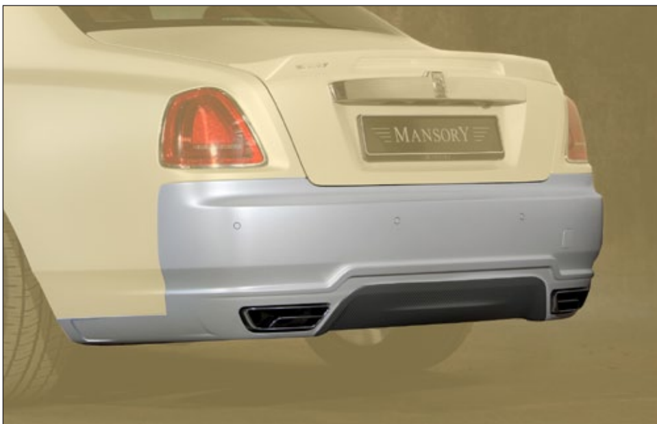
Rear bumper with visible carbon diffuser with exhaust blinds diffuser - visible carbon fibre primed without clear coat