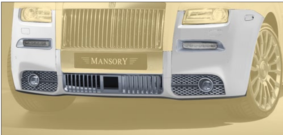
Front bumper II - LED + FOG light RR4 102 072

① compatible for cars with or without ACC sensor