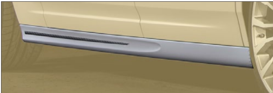
Side skirts one

2 parts set - left & right, not visible carbon fibre primed