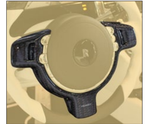
Carbon shape ..... RR4 350 751 for steering wheel visible carbon fibre glossy* ⓘ compatible with original steering wheel