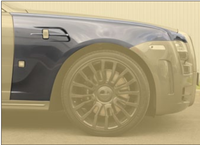
Front fenders Set one