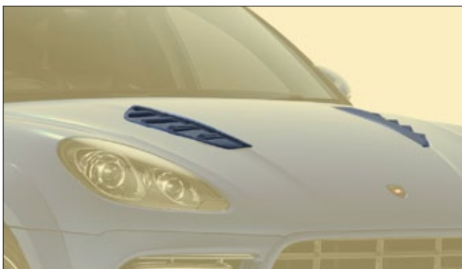
Engine bonnet air intake ..... 95B 110 101