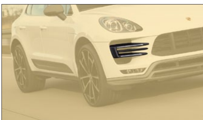
Front bumper spitter add-on - petrol ..... 95B 102 855 2 parts set - left & right, visible carbon fibre primed without clear coat