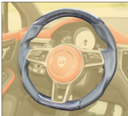
Sport steering wheel with MANSORY logo