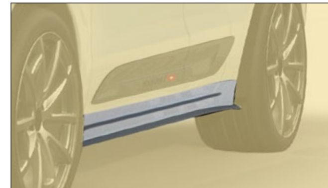
Side skirts with lip ..... 95B 595 021