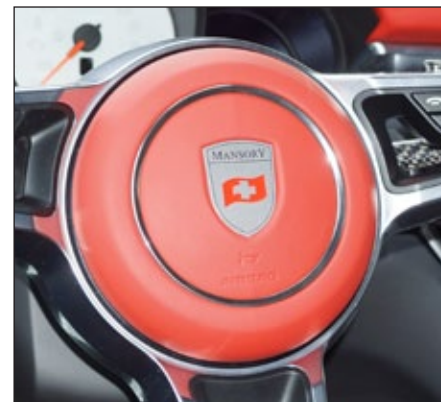
Airbag cover ..... 95B 351 500 Combination leather or alcantara, kinds of colours selectable.