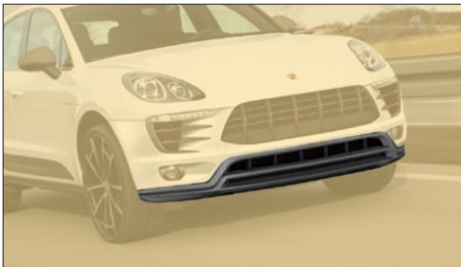
Front lip add-on DIESEL ..... 95B 102 841 for original front bumper visible carbon fibre primed without clear coat