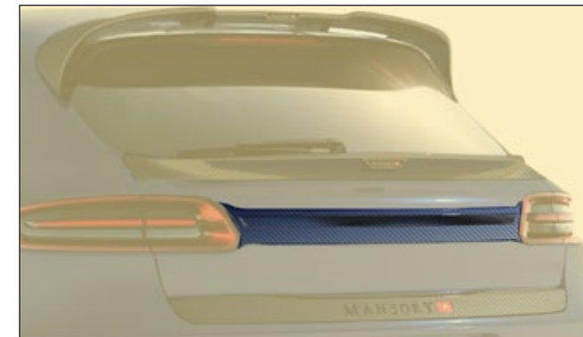
Rear panel ..... 95B 830 851 visible carbon fibre primed without clear coat