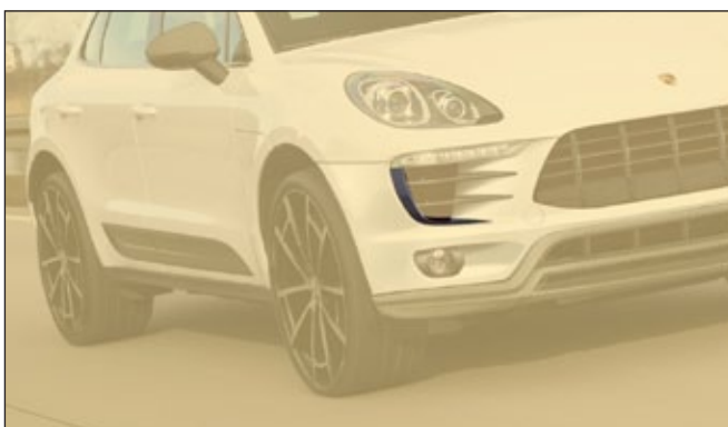
Front bumper spitter add-on - diesel ..... 95B 102 851 2 parts set - left & right, visible carbon fibre primed without clear coat

2 parts set - left & right, visible carbon fibre glossy*