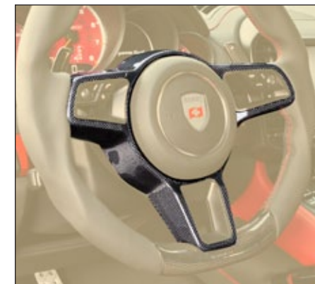
Steering wheel switch panel ..... 95B 350 751 visible carbon fibre primed without clear coat