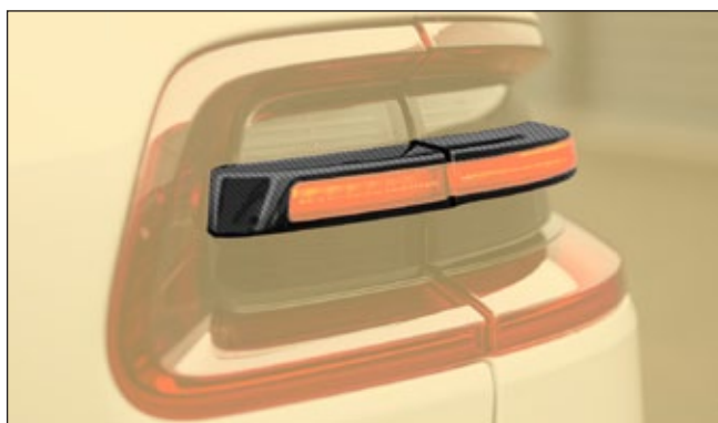
Rear light cover - visible carbon ..... 95B 804 751 visible carbon fibre primed without clear coat 4 parts set - left & right, Rear light cover ..... 95B 804 755 4 parts set - left & right, not visible carbon fibre primed