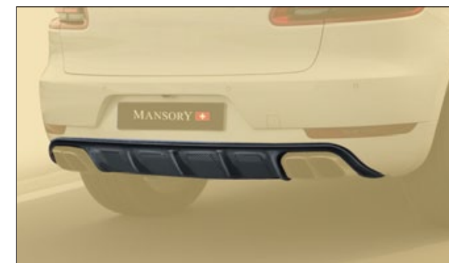
Replacement of original diffuser ..... 95B 802 881 for original rear bumper visible carbon fibre primed without clear coat