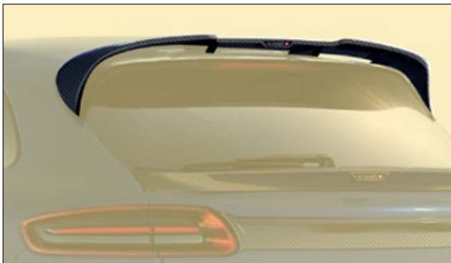
Roof spoiler - carbon ..... 95B 630 751 visible carbon fibre primed without clear coat Roof spoiler - primed ..... 95B 630 755 primed not visible carbon fibre