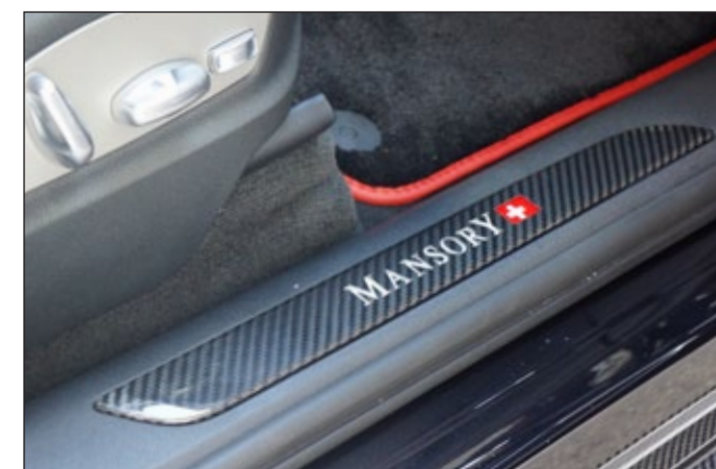
Entrance panels ..... 95B 395 301 MANSORY SWITZERLAND logo 2 parts set - front, left/right available carbon fibre or wood veneer.