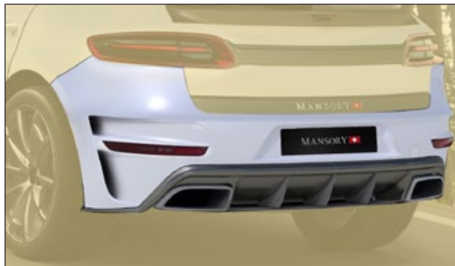
Rear bumper ..... 95B 802 021