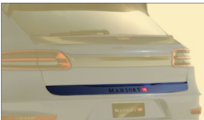
Rear hatch panel ..... 95B 802 741 with MANSORY logo visible carbon fibre primed without clear coat