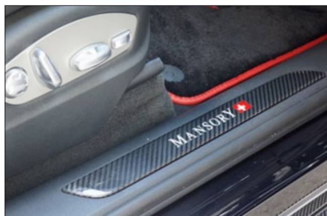
Entrance panels illuminated ..... 95B 395 351 MANSORY SWITZERLAND logo 2 parts set - front, left/right with white illuminated logo available carbon fibre or wood veneer.