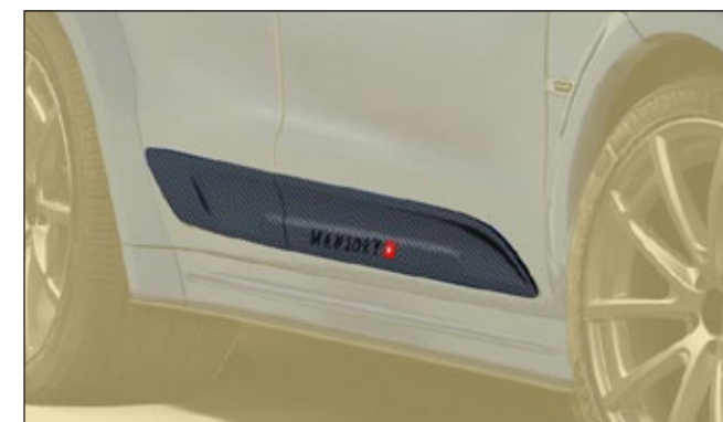
Door panel ..... 95B 131 871 4 parts set - left & right, with MANSORY logo visible carbon fibre primed without clear coat