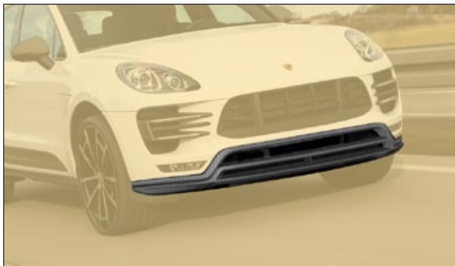
Front lip add-on PETROL ..... 95B 102 845 for original front bumper visible carbon fibre primed without clear coat