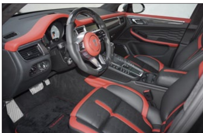
MANSORY Individualized Interior Kit ..... 95B 300 000 complete refined interior, by exclusive leather sorts, combination on customers request.