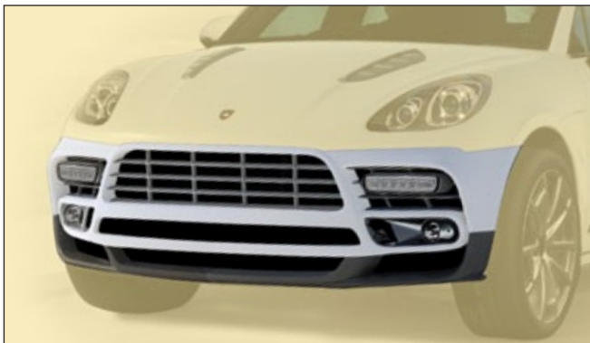
Front bumper - without radar ..... 95B 102 021