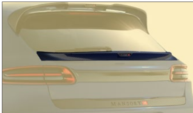
Rear deck lid spoiler - carbon ..... 95B 830 841 visible carbon fibre primed without clear coat Rear deck lid spoiler - primed ..... 95B 830 845 primed not visible carbon fibre