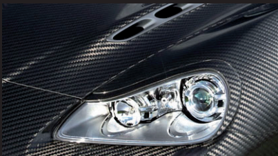
HEAD LIGHT COVER - CFK -