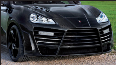
FRONT SPOILER - CFK -