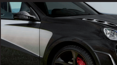
FRONT FENDER - CFK -