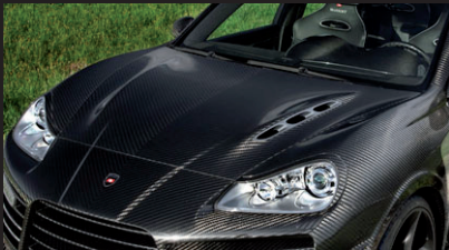
ENGINE BONNET - CFK -