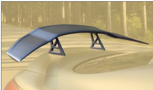
Rear high performance wing ..... 217 830 331 3 parts set, (wing, foots) visible carbon fibre without clear coat