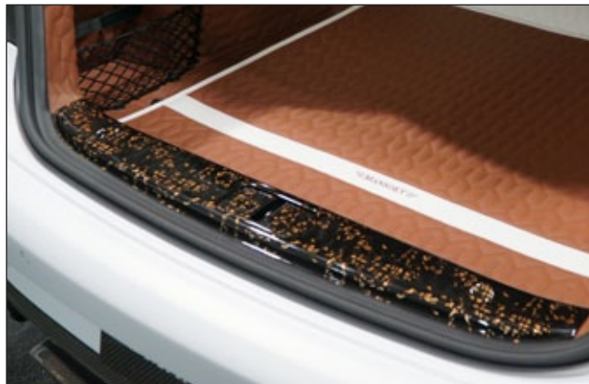
Trunk panel ..... 217 359 333 visible carbon fibre primed without clear coat