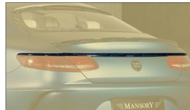
Rear bar ..... 217 802 751 3 parts set visible carbon fibre primed without clear coat