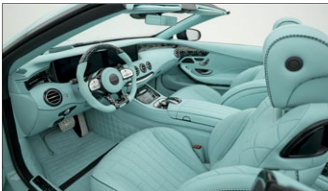
Interior individualized modification ..... 217 300 000 Complete refined interior, by exclusive leather sorts, combination on customers request.