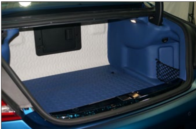
Trunk house decor ..... 217 368 500 with MANSORY logo stitching, color of velour, leather selectable