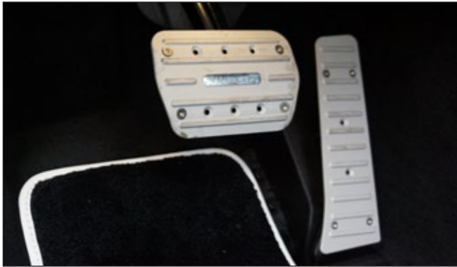
Pedals pads ..... 217 367 117 brake and acc. pedal