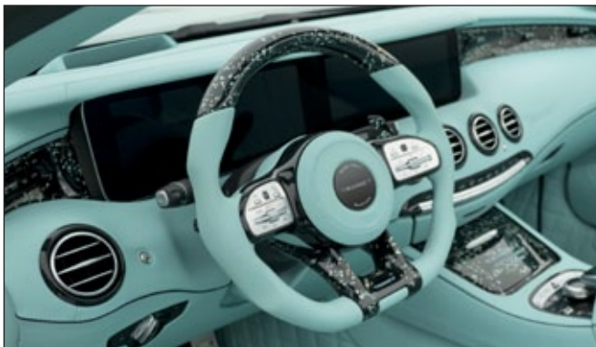
Sport steering wheel ..... 217 351 411 leather, carbon color of leather selectable with MANSORY logo (C) modification only, OE-part required