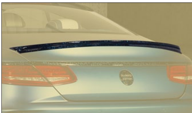
Rear deck lid spoiler coupe - visible carbon fibre primed without clear coat ..... 217 830 841 cabrio - visible carbon fibre primed without clear coat ..... 217 835 841 coupe - primed not visible carbon fibre ..... 217 830 842 cabrio - primed not visible carbon fibre ..... 217 835 842