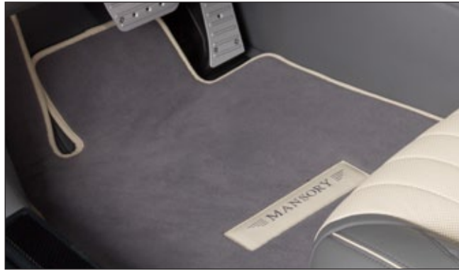
Floor mats ..... 217 367 758 4 parts set - left & right, with MANSORY logo stitching, color of velour, leather selectable