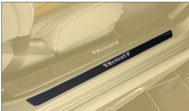
Entrance panels with logo ..... 217 395 301 Set 2 pcs - left / right Entrance panels with illuminated logo ..... 217 395 351 Set 2 pcs - left / right