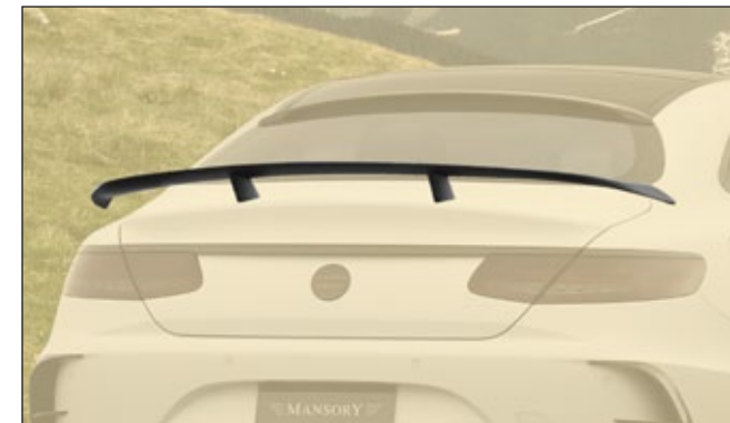
Rear dynamic performance wing ..... 217 830 341 visible carbon fibre without clear coat