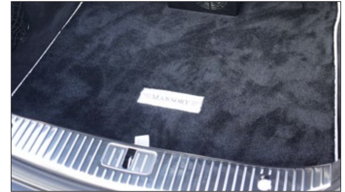
Trunk floor mat ..... 217 368 758 with MANSORY logo stitching, color of velour, leather selectable