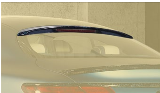
Roof spoiler visible carbon fibre primed without clear coat ..... 217 630 751 primed not visible carbon fibre ..... 217 630 752