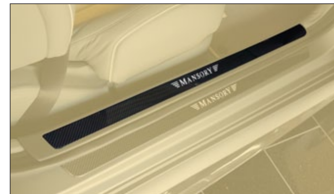
Entrance panels inner with logo ..... 217 395 331 Set 2 pcs - left / right