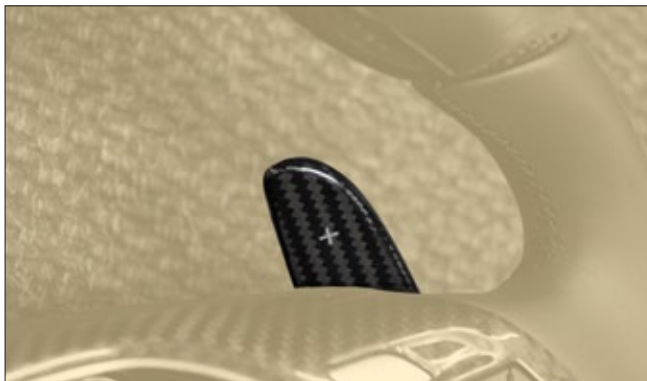
Shift paddles ..... 217 350 011 Visible carbon fibre