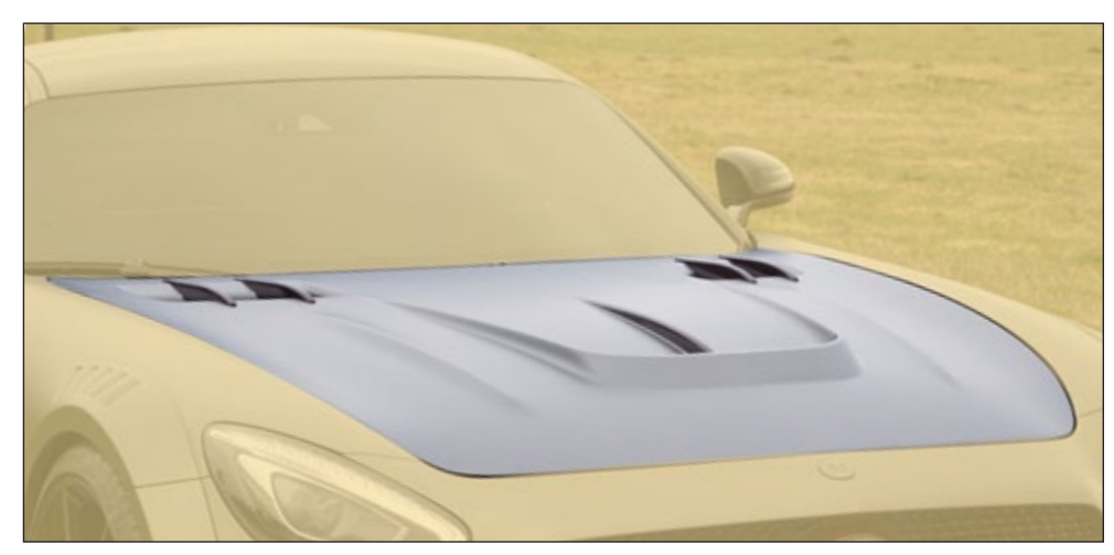
Engine bonnet primed bonnet - not visible carbon fibre primed air intake / outtake visible carbon fibre primed without clear coat