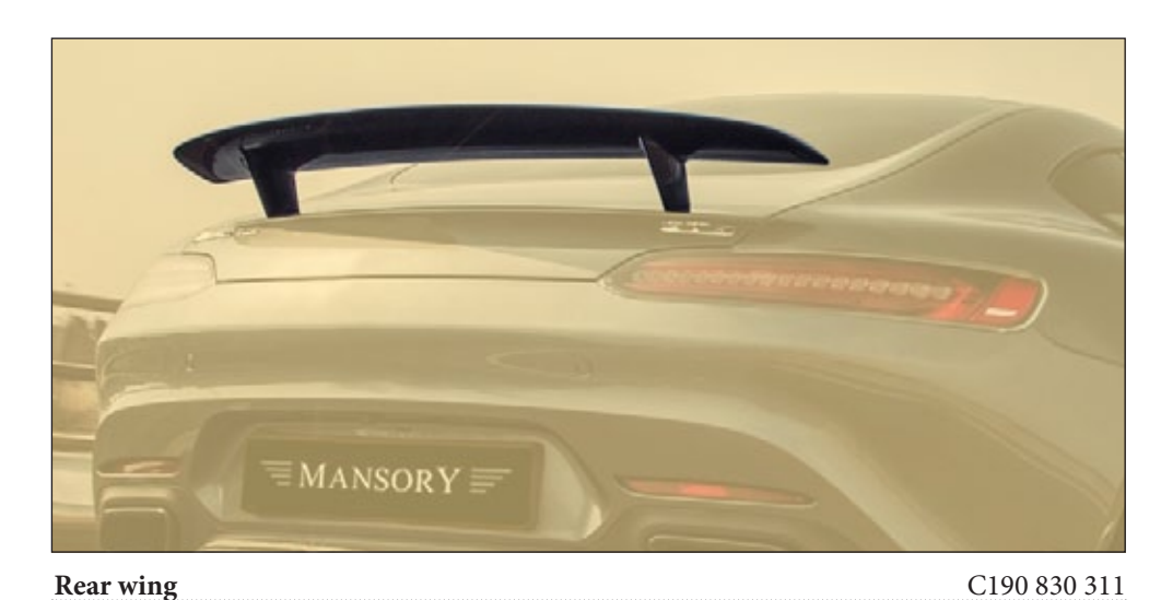
visible carbon fibre with clear coat