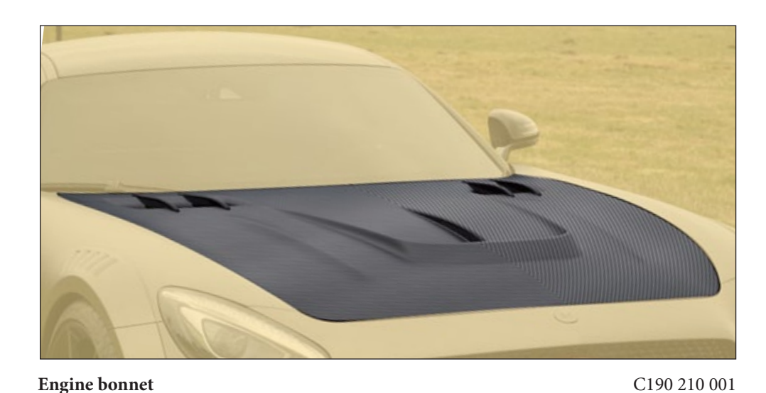
Engine bonnet visible carbon fibre primed without clear coat air outtake fin covers, center air intake - visible carbon fibre primed without clear coat