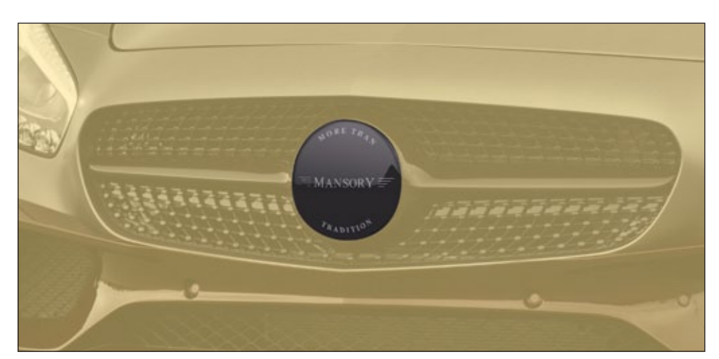
Front grill mask emblem with MANSORY Branding