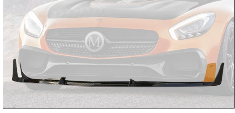
Add on parts for front bumper - high side flap

front lip - visible carbon fibre primed without clear coat front bumper extension part - not visible carbon fibre