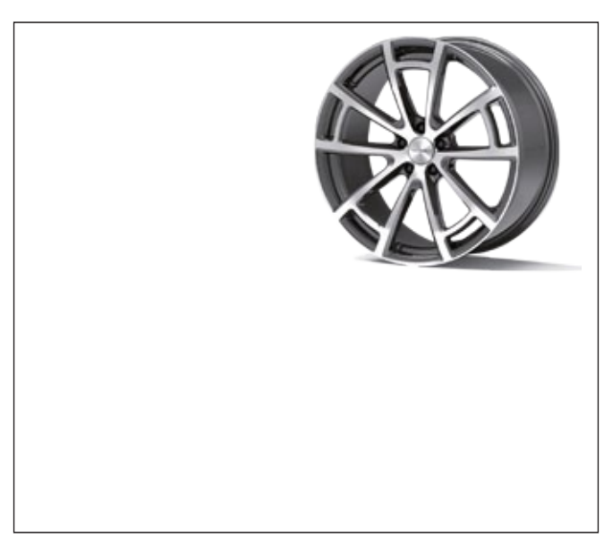
CS.5 wheel - only for Wide body Kit