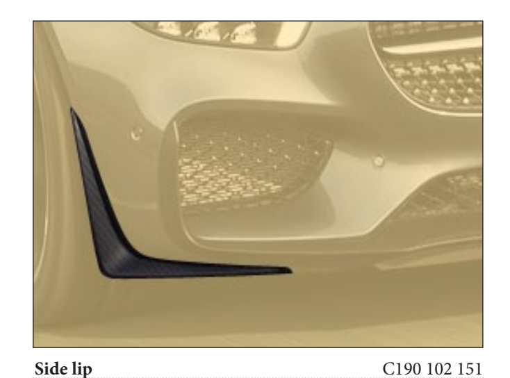
2 parts set - left & right visible carbon fibre with clear coat