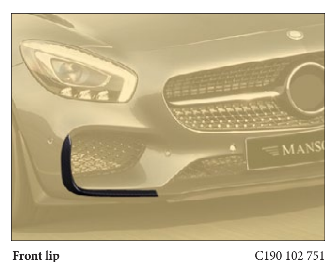
2 parts set - left & right visible carbon fibre with clear coat