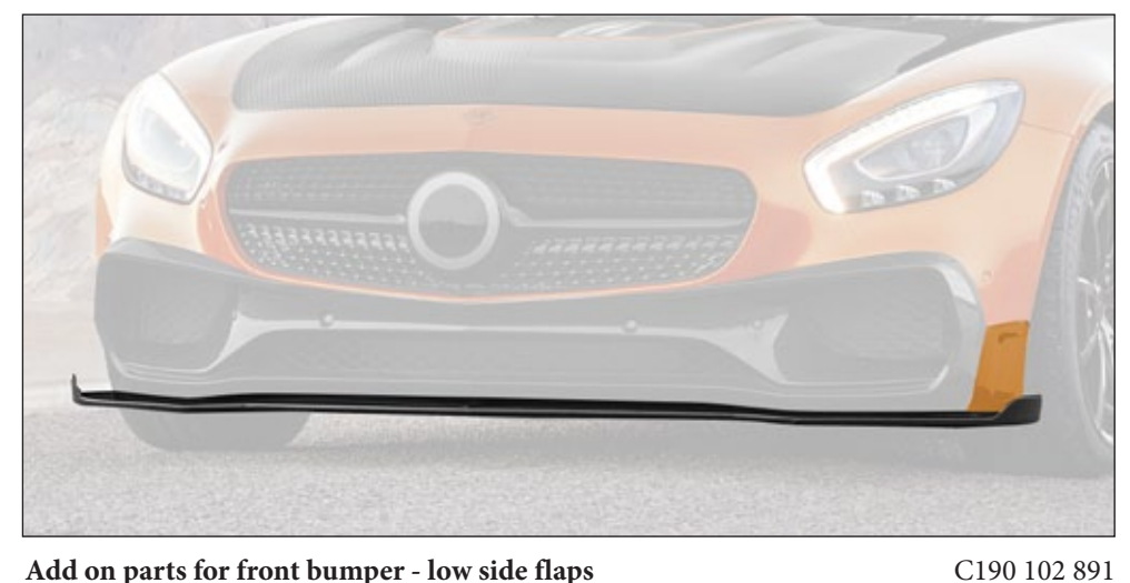
Add on parts for front bumper - low side flaps

front lip - visible carbon fibre primed without clear coat front bumper extension part - not visible carbon fibre