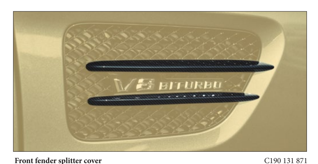
Front fender splitter cover 4 parts set - left & right visible carbon fibre with clear coat