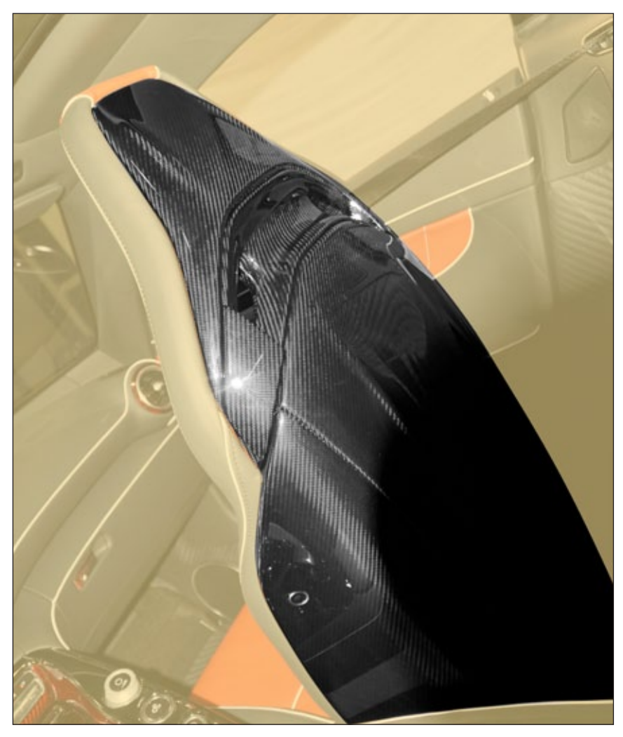
Carbon cover - seat rear panel