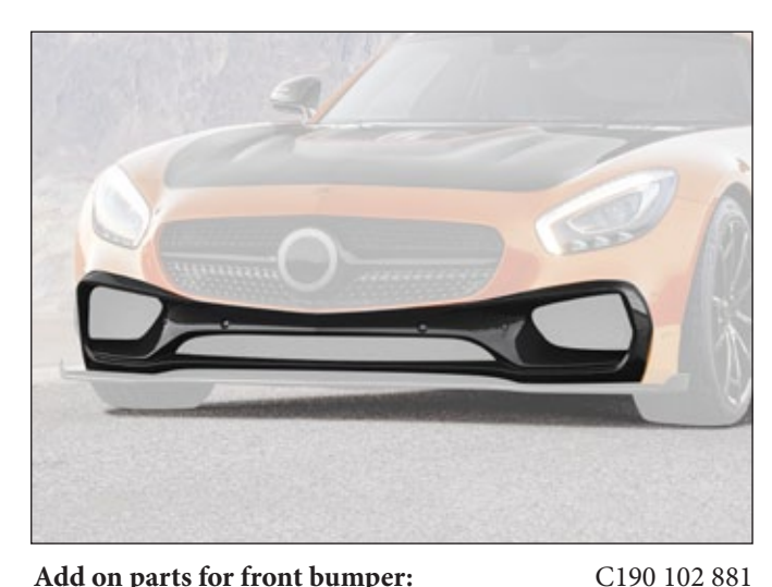
Add on parts for front bumper:

front lip - visible carbon fibre primed without clear coat front bumper extension part - not visible carbon fibre