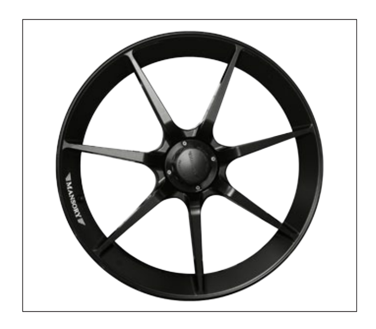
7-spoke central lock rims