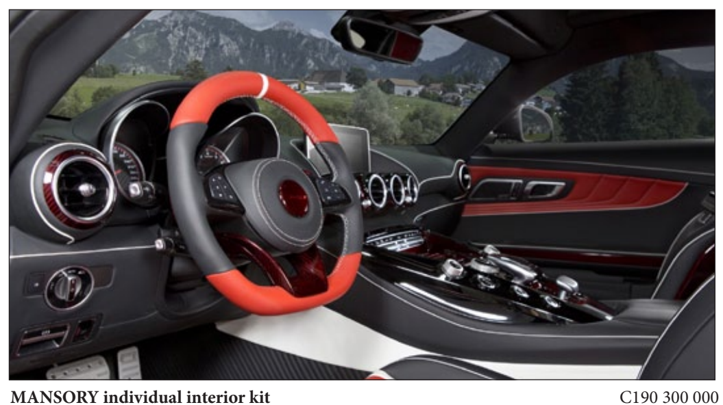
MANSORY individual interior kit

Complete refined interior, by exclusive leather sorts, combination on customers request.