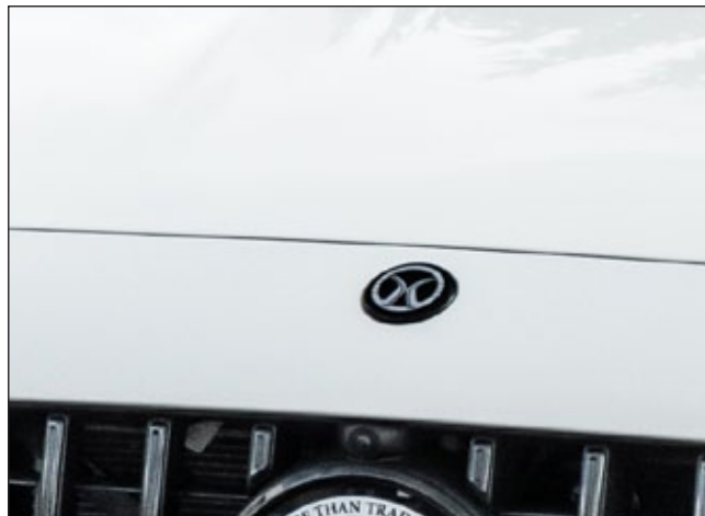
Front bumper emblem with logo