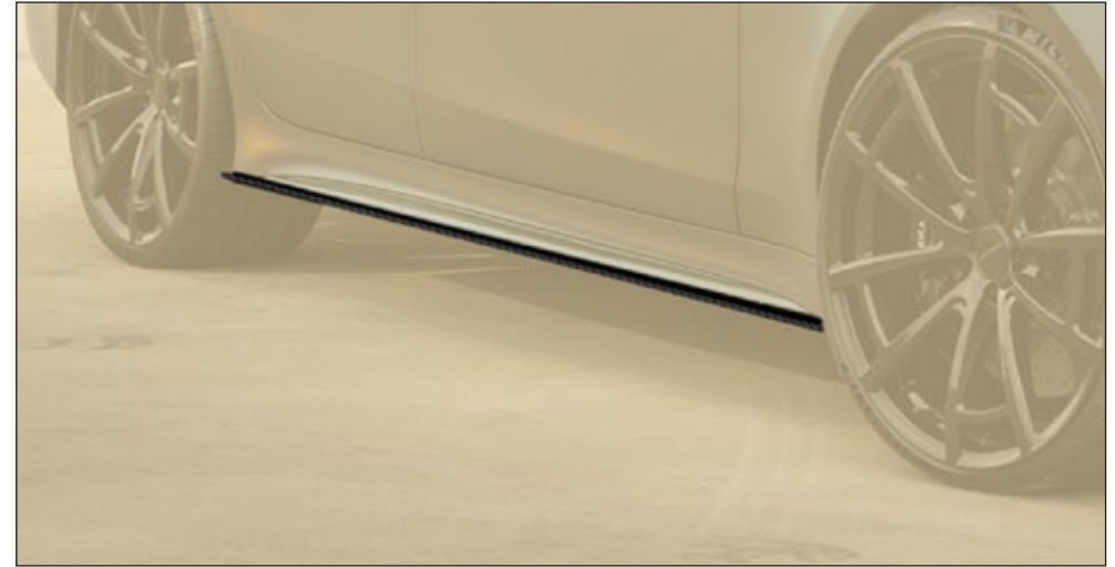
Side skirt lips

visible carbon fibre primed without clear coat