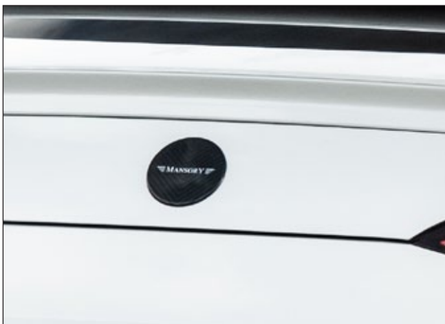
Rear hatch emblem