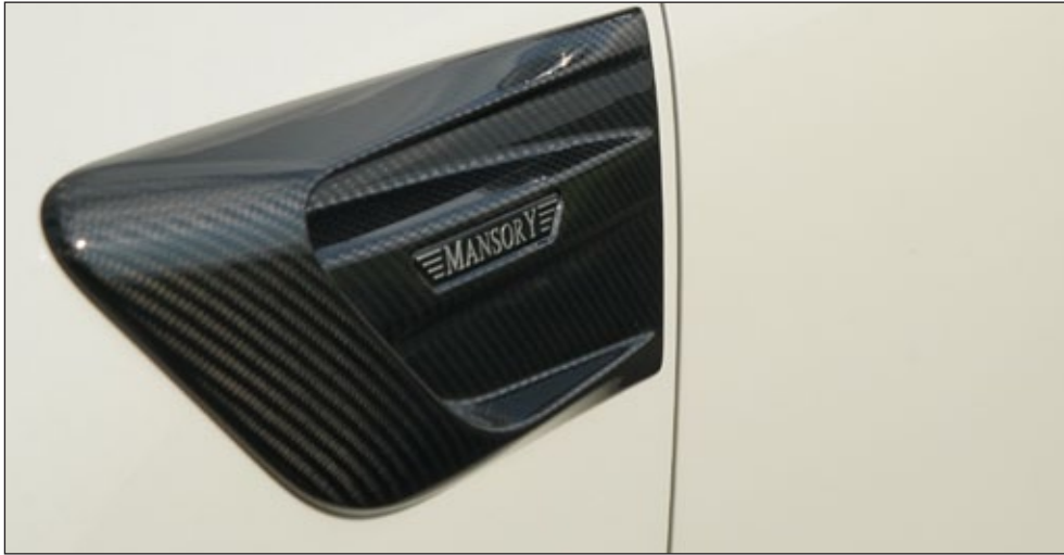
Front fender emblem with MANSORY logo