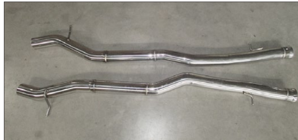
Exhaust middle pipes