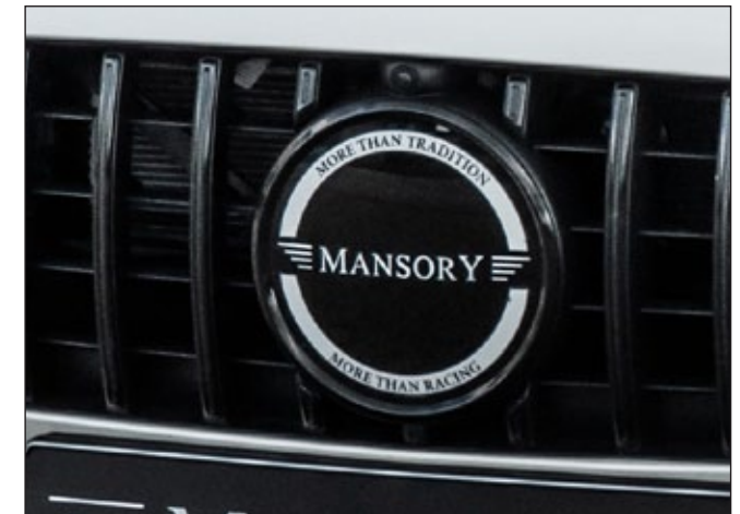
Front grill mask emblem with MANSORY Branding