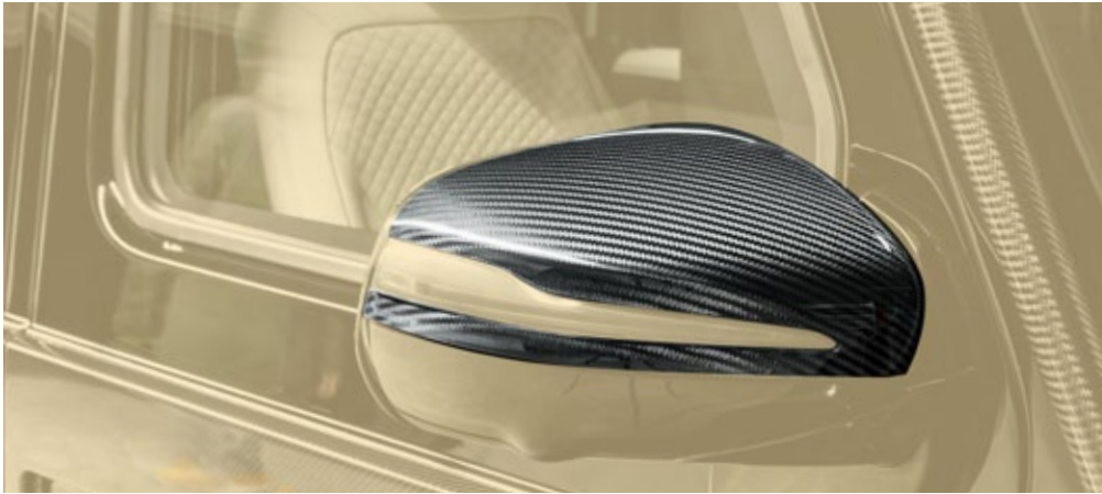
Carbon mirror housing I.

2 parts set - left & right visible carbon fibre glossy*