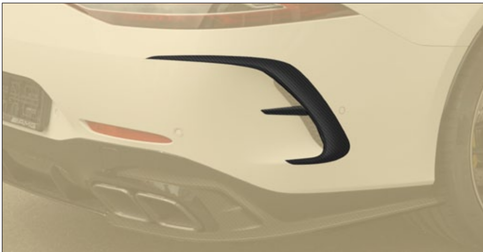
Air outtake splitter

visible carbon fibre primed without clear coat