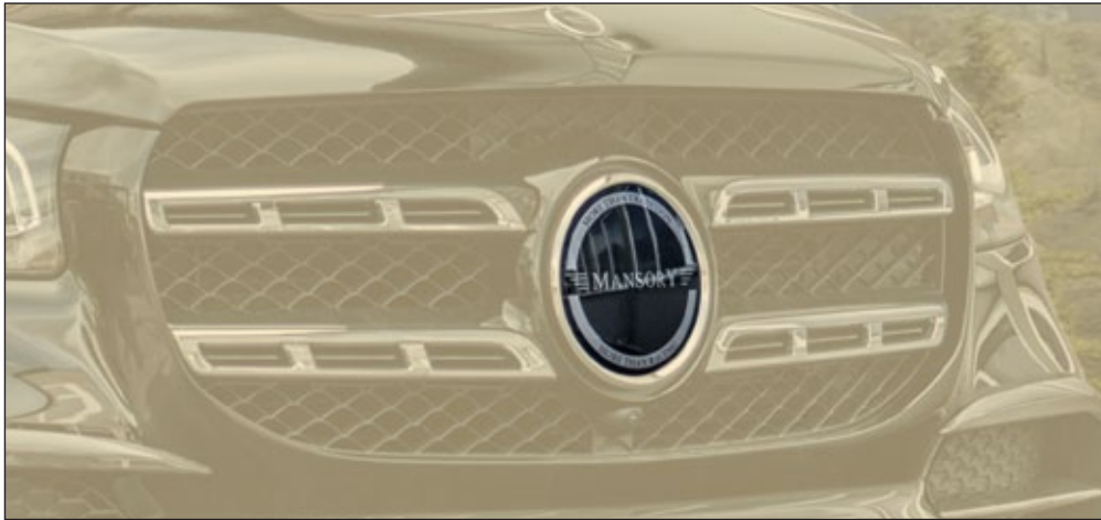
MANSORY logo for grill mask