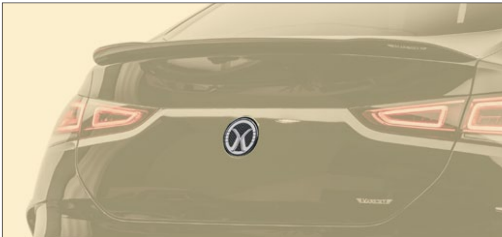
Rear hatch emblem