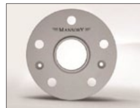
Spacer adapter kit for 23 inch wheel

✂ recommended tyre size - 295/35 23 Continental SC6 ⓘ Spacer adapters kit must be ordered separately