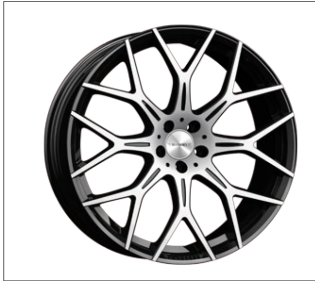
N.80 Wheels 23inch