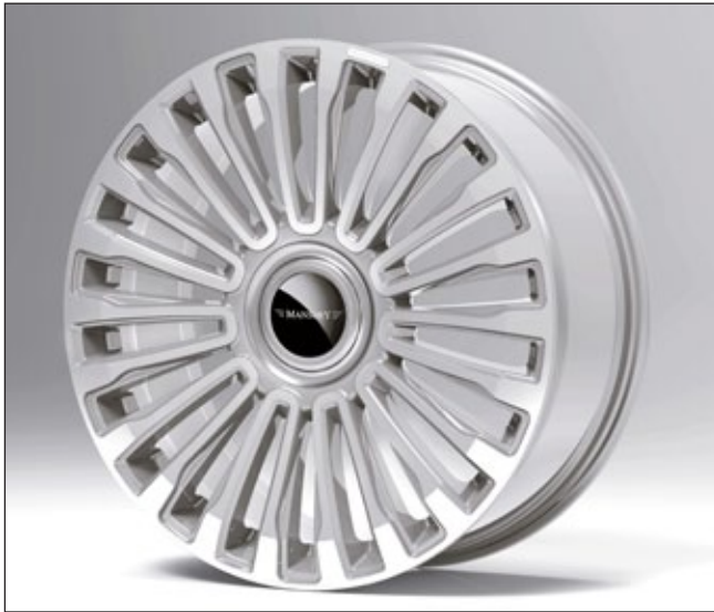
CS.11 21 inch ( Diamond silver ) front: 9x21 ET30 (5/112-5/130) CS11 21 9 30 1230 S rear: 10,5x21 ET42 (5/112-5/130) CS11 21 105 42 1230 S

* price per piece, without tire * individual paint or request ⓘ adaptor kit must be ordered separately