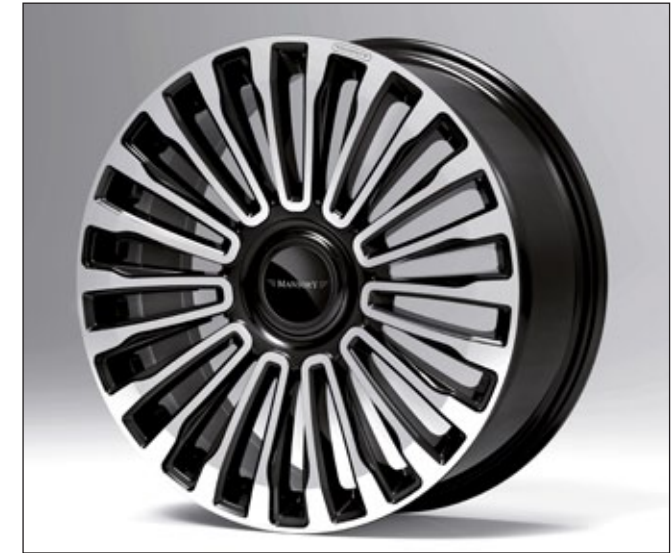
CS.11 21 inch ( Diamond black ) front: 9x21 ET30 (5/112-5/130) CS11 21 9 30 1230 B rear: 10,5x21 ET42 (5/112-5/130) CS11 21 105 42 1230 B

✂ Recommended Tires 21 inch - FA: 255/35/21, RA:295/30/21 22 inch - FA: 255/30/22, RA:295/25/22