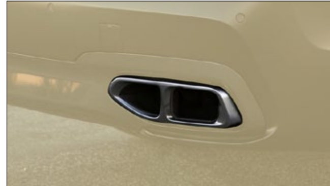
Exhaust tip Black Chrome left (Original part 51128069687- no discount) ..... 717 805 8BL right (Original part 51128069688- no discount) ..... 717 805 8BR