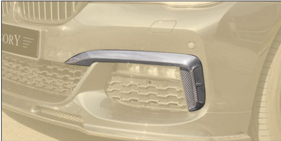
Front splitter - carbon