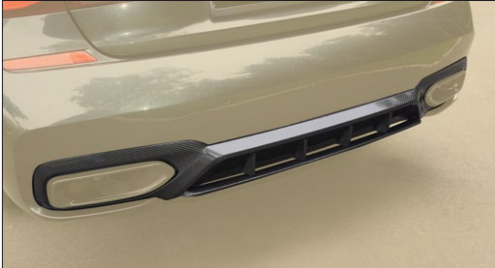
Rear diffuser with diffuser board ..... 717 802 991 visible carbon fibre glossy* ⓘ compatible only with M Sportpaket / M Performance