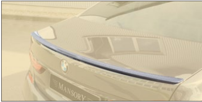
Rear decklid spoiler - carbon ..... 717 830 841 visible carbon fibre glossy* Rear decklid spoiler - primed ..... 717 830 845 primed not visible carbon fibre