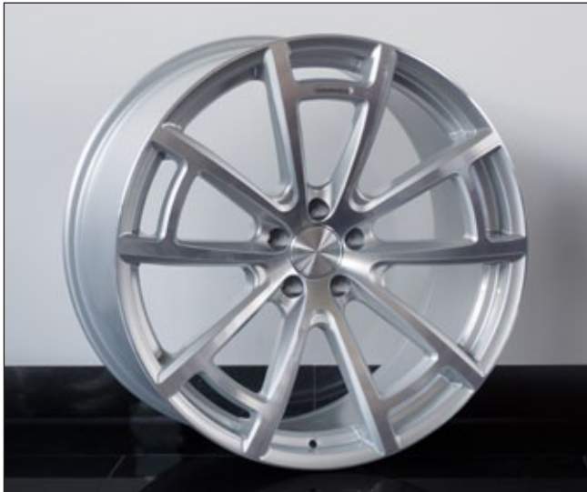
CS.5 21 inch ( Diamond silver )

front: 9,5x21 ET35 (5/112) CS5 21 95 35 112 S rear: 10,5x21 ET35 (5/112) CS5 21 105 35 112 S