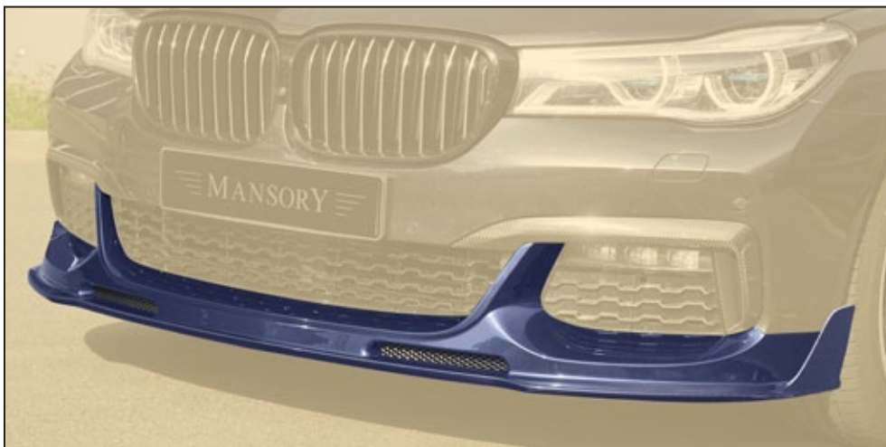
Front lip with side flaps - primed

ⓘ compatible only with M Sportpaket / M Performance