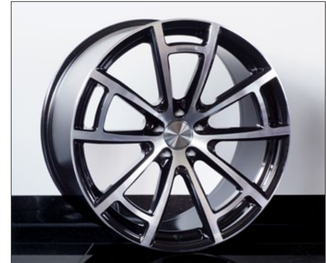
CS.5 21 inch ( Diamond black )

21 inch - FA: 255/35/21, RA:295/30/21 22 inch - FA: 255/30/22, RA:295/25/22