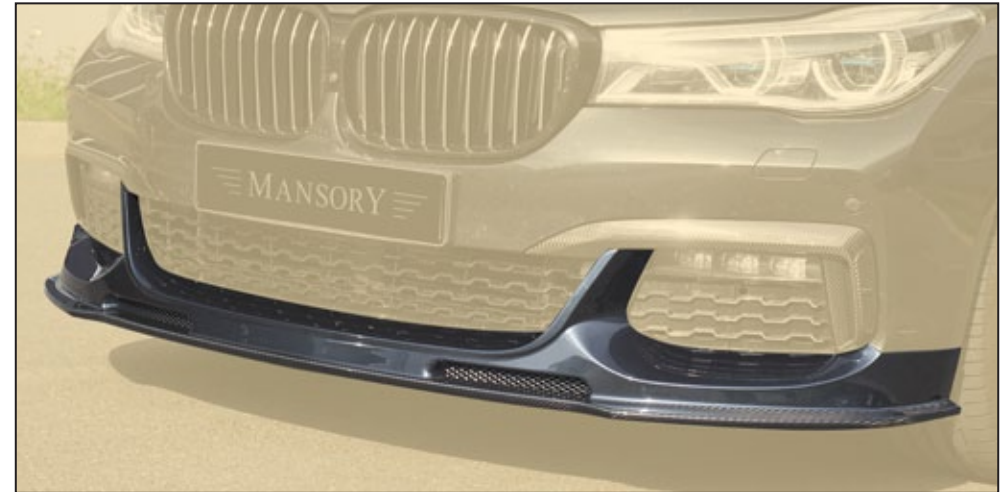
Front lip - carbon

ⓘ compatible only with M Sportpaket / M Performance