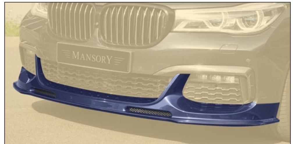
Front lip - primed

ⓘ compatible only with M Sportpaket / M Performance