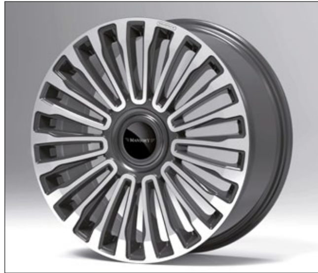
CS.11 21 inch ( Diamond anthracite ) front: 9x21 ET30 (5/112-5/130) CS11 21 9 30 1230 A rear: 10,5x21 ET42 (5/112-5/130) CS11 21 105 42 1230 A

✂ Recommended Tires 21 inch - FA: 255/35/21, RA:295/30/21 22 inch - FA: 255/30/22, RA:295/25/22