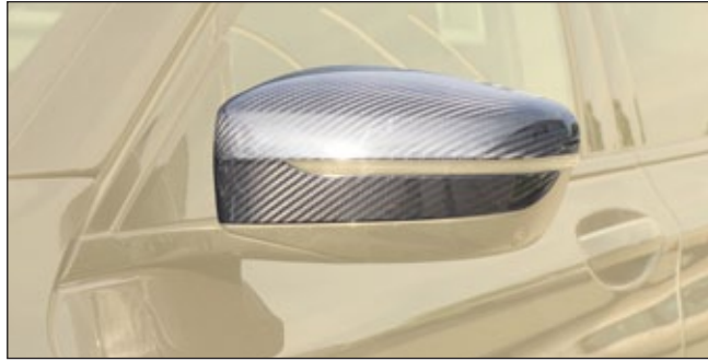
Carbon mirror cover ..... 717 522 201 with MANSORY logo 2 parts set - left & right, visible carbon fibre glossy*