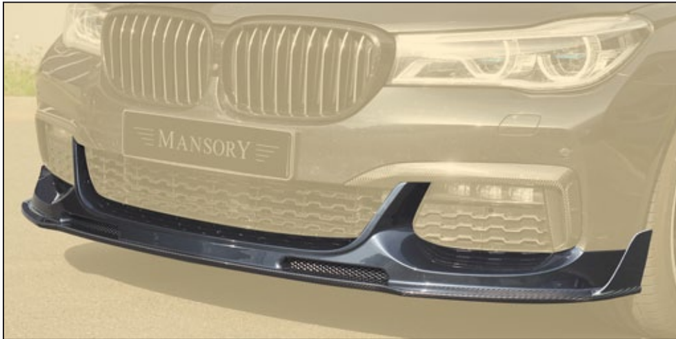
Front lip with side flaps - carbon