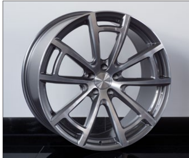
CS.5 21 inch ( Diamond anthracite )

21 inch - FA: 255/35/21, RA:295/30/21 22 inch - FA: 255/30/22, RA:295/25/22