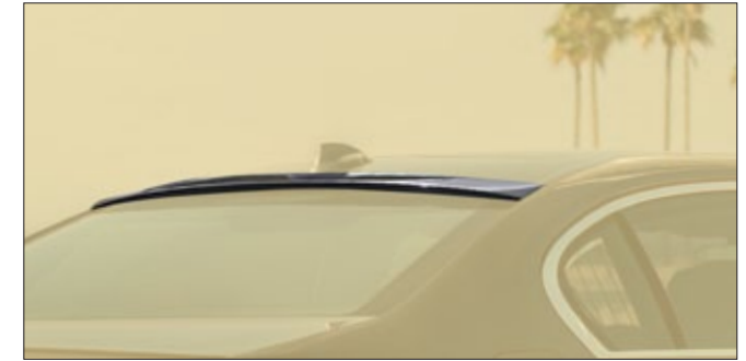
Roof spoiler - carbon ..... 717 630 751 visible carbon fibre glossy* Roof spoiler - primed ..... 717 630 755 primed not visible carbon fibre