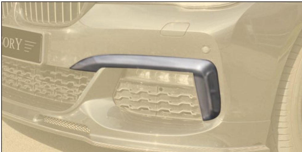
Front splitter - primed