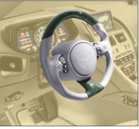
Sport steering wheel with MANSORY logo

leather/carbon D11 351 441 D11 351 445 leather/wood leather/leather D11 351 444