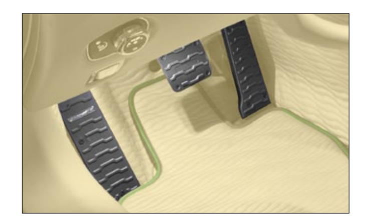
Pedal Set 3-parts, footrest, accelerateand break pedals with MANSORY logo aluminium punched