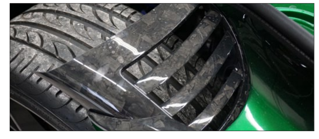
Slats for front wheel arch visible carbon fibre glossy*

2 parts set - left & right, visible carbon fibre glossy*