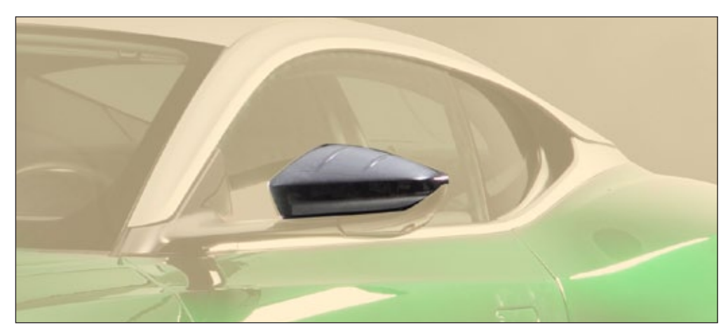
Carbon mirror housing LHD Carbon mirror housing RHD

2 parts set - left & right, visible carbon fibre glossy*