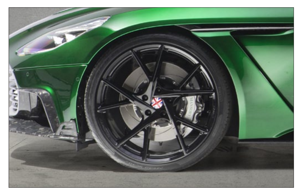
YN.5 wheel ultra-light forged wheels