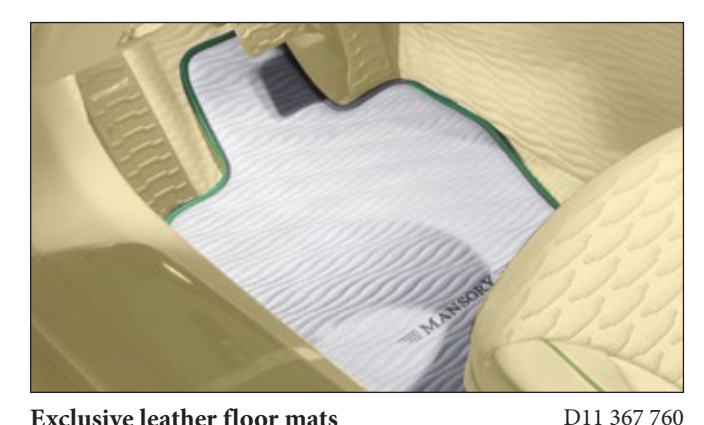
Exclusive leather floor mats 4-parts set with MANSORY logo stitching Special designs optionally available on customers request.