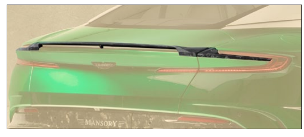
Rear decklid spoiler - carbon